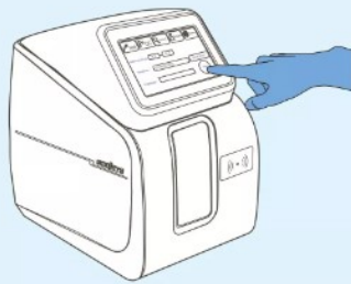
Click to START