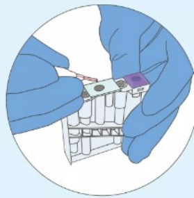
Collect 5 \mu L sample, insert the pipette into R1 position